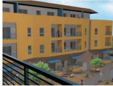
View from balcony, looking northwest