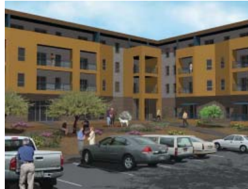
View looking southwest from parking lot